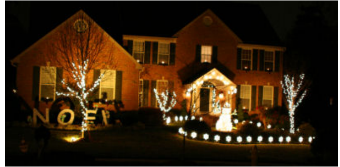
400 Little Marvel Court

Bus trip to the New York City. While a few in our group braved the cold and spent the entire day shopping in the Big Apple, many of us warmed up mid-day with the always-captivating Radio City Christmas Spectacular. We have already tentatively book 2007's trip for Friday, December 7 th !