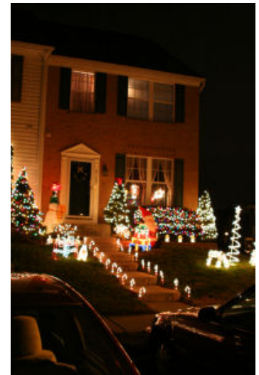
8102 GreyStone Lane